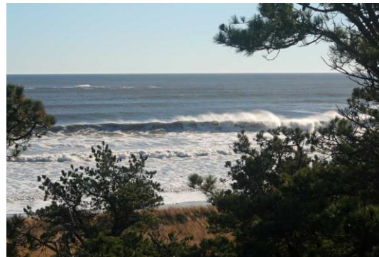
View of surf and beach from Seagontz