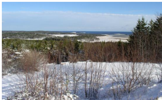
View of Seguin Island and ocean from Eyrie and Easterly