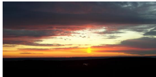
Sunset, New Year's Eve, Dec 2003