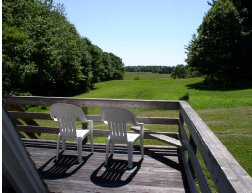
View from A-frame deck

To reach Seawall Beach from 1877 or the A-frame, enjoy a walk 1.5 mile trail through woods of the Bates-Morse Mountain Conservation Area, canoe/kayak via the Morse River, or drive 4 miles. Good canoeing, kayaking and swimming on the tidal Morse River are only 200 yards from 1877 House and A-Frame.