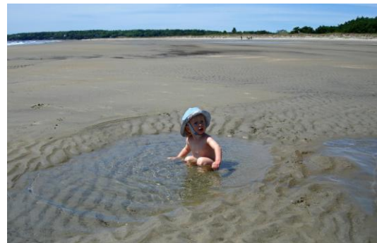
Summer at Seawall Beach